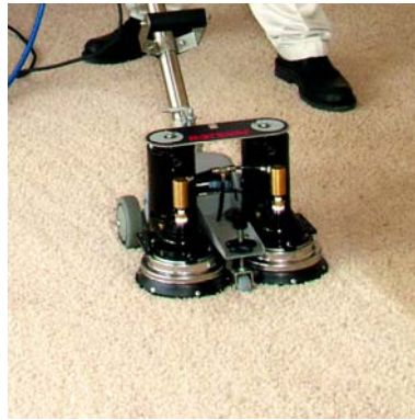
Deep Extraction Carpet Cleaning gets right down to the base of your carpet to remove harmful grit, dirt, stains and pollutants.