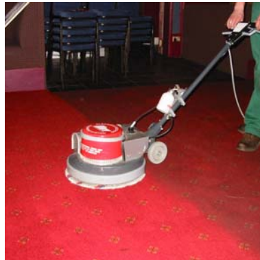
Carpets Dry in 30 minutes With Dry Fusion your carpets are left clean, dry and ready-to-walk-on just 30 minutes after cleaning.