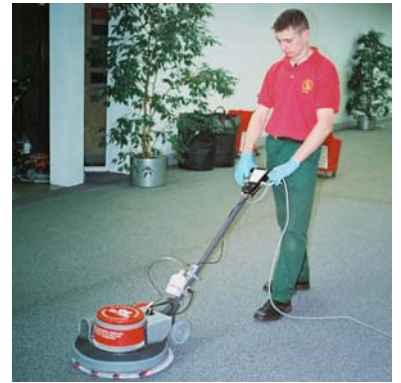
Dry Fusion is an outstanding low-moisture, quick-drying system for carpets, carpet tiles and oriental rugs – domestic or commercial.