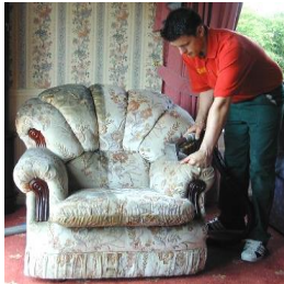
Upholstery and Soft Furnishings A deep extraction clean of your upholstery and soft furnishings highlights the colours and patterns.