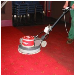
Carpets Dry in 30 Minutes With Dry Fusion your carpets are left clean, dry and ready-to-walk-on just 30 minutes after cleaning.