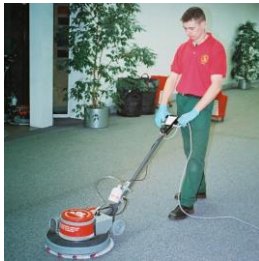
Dry Fusion Cleaning is a great low-moisture, quick-drying system for carpets, carpet tiles and rugs – domestic or commercial.