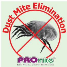
Allergy Sufferers Benefit from our Dust Mite elimination programme for carpets, upholstery and mattresses.