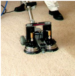
Deep Extraction Carpet Cleaning Cleaning right down to the base of your carpet to remove harmful grit, dirt, stains and pollutants.