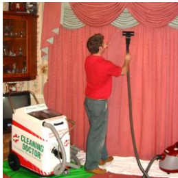
Curtain Cleaning Curtains, swags, tails and pelmets all cleaned on site – there is no need to take down for cleaning.