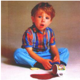
Fabric & Fibre Protection Stain protector applied to your carpets and soft furnishings makes this less of a disaster.