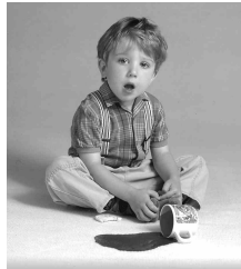
Stain Protector for carpets makes this less of a disaster.