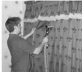
Curtains Cleaned in situation – there is no need to take them down.