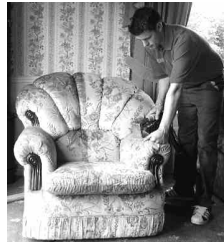
Upholstery, including leather cleaned & restored.