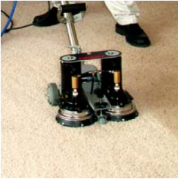
Deep Extraction Carpet Cleaning Cleaning right down to the base of your carpet to remove harmful grit, dirt, stains and pollutants.