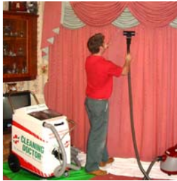
Curtain Cleaning Curtains, swags, tails and pelmets all cleaned on site – there is no need to take down for cleaning.