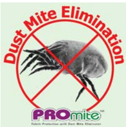
Allergy Sufferers Benefit from our Dust Mite elimination programme for carpets, upholstery and mattresses.