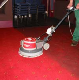
Carpets Dry in 30 Minutes With Dry Fusion your carpets are left clean, dry and ready-to-walk-on just 30 minutes after cleaning.