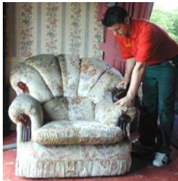
Upholstery and Soft Furnishings A deep extraction clean of your upholstery and soft furnishings highlights the colours and patterns.