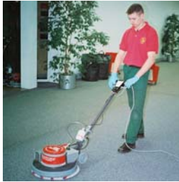
Dry Fusion Cleaning is a great low-moisture, quick-drying system for carpets, carpet tiles and rugs – domestic or commercial.